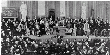
The Chicago parliament: Vivekananda clearly made an impression.

this period led via Singapore and Shanghai, and then to Japan and the West Coast of America. This gave Vivekananda his first opportunity to see East Asian cultures and appreciate the links between Asian religions and cultures that could be seen through Buddhist temples and traditions. The great Columbian Exposition of 1893 was a world fair organised in the tradition of the first French expositions and then the Crystal Palace Exposition of 1855 in London. The aim of such events was to show how