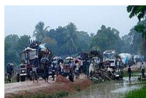
Civilians being displaced as a result of Sri Lanka Army's military offensive, January 2009.

result of any new information. A recent study entitled The numbers game by a Sri Lankan expatriate writing for personal reasons under the pseudonym Citizen Silva has made an important contribution to the debate on what happened in his country by explaining where these estimates come from, questioning the assumption generally made by journalists that we cannot come to any conclusions without an international investigation.