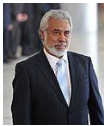
Xanana Gusmao: expected to leave active politics soon.

On this basis, Timor-Leste looks, sooner or later, to be headed towards an economic crisis. Coming from an already low and fragile development base, the social consequences of this economic crisis would likely play out in the political field.