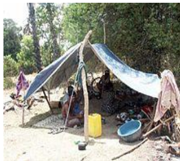
Displaced persons from the civil war in makeshift shelter.

A local human rights group has claimed that the LTTE maintained a strength of 15 000 until the very end by means of absolutely ruthless conscription. They have said, 'They were conscripted and used briefly like disposable objects, were brought by the dozens, about 50 a day on average, on trailers of tractors and buried unceremoniously, about three in the same hole, one above the other, covered and forgotten.'