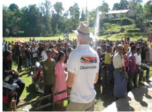
Presidential election rally, 2012.

Critically, 70 per cent of the population was under 30 years of age while unemployment, notoriously difficult to determine in a country that has never had much formal employment, remained disturbingly high. One view that was widely discussed, although rarely formally articulated, was that the rapidly