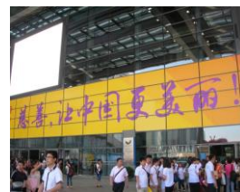
Shenzhen Convention and Exhibition Centre.

There appeared to be a substantial increase in the number of small philanthropic organisations, but a decrease in the number of government-run provincial and charity federations. Government austerity measures introduced in December 2012 perhaps reduced the number of people who attended the fair as provincial government-sponsored delegates