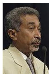
Mari Alkatiri: resigned as prime minister under intense pressure.

Yet following independence, Timor-Leste quickly descended into increasing disorder, culminating in 2006 in a split within the army. This then spilled into confrontation between the army and the police, gang warfare, the deaths of dozens of people, the burning of thousands of homes and the displacement of around 15 per cent of the population. The country was divided into pro- and anti-Fretilin camps, approximately aligned in an east and west geographic orientation. The country was close to becoming a failed state.