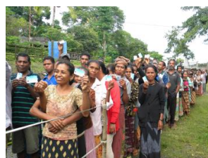
Voters queue to cast their ballots in the 2012 elections.

It was, of course, too soon in 2007 to say that Timor-Leste had consolidated its democracy. To the extent that Timor-Leste has done so since, there remain questions about its completeness and, more importantly, its longer term viability.