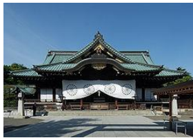
Yasukuni Shrine: Class 'A' war criminals are among those enshrined there.

sent kamikaze pilots to their certain death. On the 50th anniversary of the end of the war, I dropped by the history club at Waseda University, one of the country's leading institutions. I asked the students whether they subscribed to the view 'history is written by the winners'. Most did. I asked whether the United States had been justified in using the atomic bombs. None. I asked how many had heard of the Kokoda Track. None.