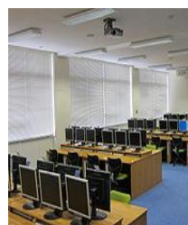
Language labs: no longer cutting-edge technology?

The cutting-edge technology of the 21st century, however, is mobile computing and, as many have shown, the iPod and self-directed or peer-directed learning can make the hours previously dedicated to language laboratory obsolete.