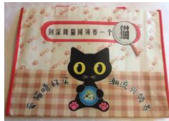
Adopt a cat message.

were also strongly in evidence. They included community groups and social work organisations advertising services for the elderly, people living with physical and mental challenges, and families with children suffering from autism, leukaemia and other medical conditions.