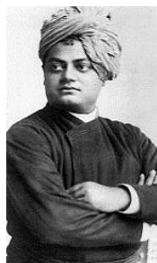
Swami Vivekananda in Chicago, September 1893.

countries as diverse as Armenia and China also lived there.