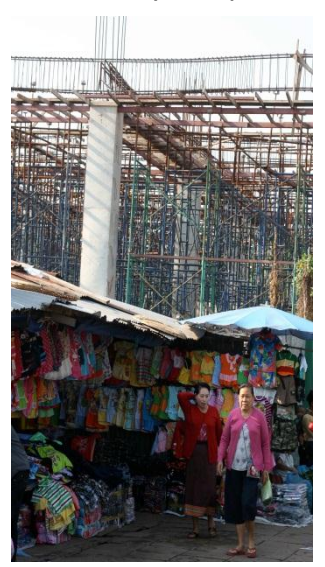
New developments converge on old markets in Vientiane.

It was in the early 1980s that the Lao Government began taking the first steps towards liberalising its economy and opening its borders to foreign trade flows. Since then, transforming Laos from a 'landlocked' to a 'landlinked' country has been a key component of the government's efforts to promote foreign investment and provide improved transportation networks for the country's exports.