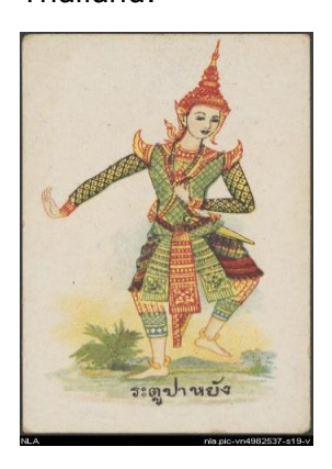
The battles of the Ramayana:Thai cigarette cards from the 1920s (THRB 6)

which tells the story of the Buddhist saint Phra Malai. Tales of Phra Malai's journeys to heaven and hell are used to preach Buddhism and are well known in Southeast Asia. They remain especially popular in Thailand. The manuscript would have been copied by Buddhist monks and is made from the bark of the khoi tree, which grows in northern Thailand.