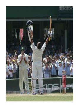
Ektaal would go beyond cricket, curries and Commonwealth.

Confederation of Indian Industry linking their part in the <a href="india">india</a> @ 75 project with an $11.4 million <a href="Ektaal">Ektaal</a> scholarship fund designed to support the delivery of the india @ 75 objectives through PhD study at Macquarie. The university was also the founding sponsor of the Australia India Youth Dialogue.